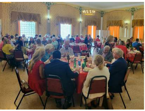
Sunday Lunch at the Hungurian Center